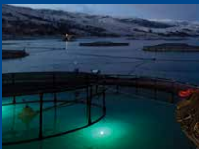
LED lighting at Spelve, Mull

‘Off the back of the success of the Spelve system, we will be looking to work with Aqua Power Technologies to identify other farms where energy use profiles would indicate its suitability. There is a clear opportunity for the company to reduce its reliance on fossil fuels and, in doing so, significantly reduce carbon emissions.’